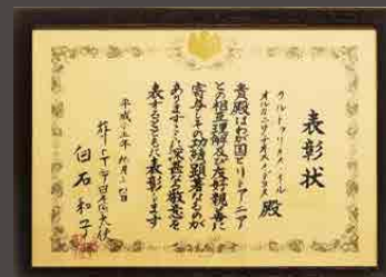
The Commendation to the festival “nowJapan” from Embassy of Japan, Lithuania, 2013

Held annually from 2009, every year it attracts more than 8000 visitors