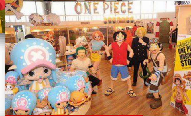
The 1 st Flagship Store in Thailand